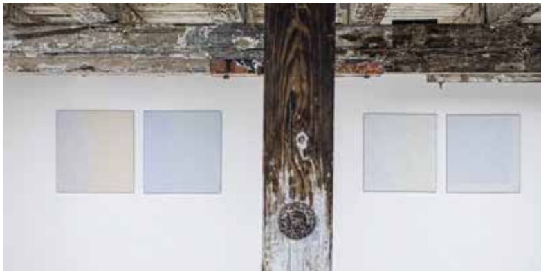
CHRISTA BARTESCH / Cím NÉLKÜL (Fehér képek 1-4), 2006 / Oil on canvas

72. One thing was irrefutably clear to Goethe: no lightness can come out of darkness – just as more and more shadows do not produce light. This could be expressed as follows: we may call purple a reddish-whitish-blue or brown a blackish-reddish-yellow – but we cannot call a white a yellowish-reddish- greenish-blue, or something similar. And that is something that experiments with the spectrum neither confirm nor refute. It would, however, also be wrong to say, 'just look at the colours in nature and you will see that it is so.' Therefore looking does not teach us anything about the concepts of the colours."