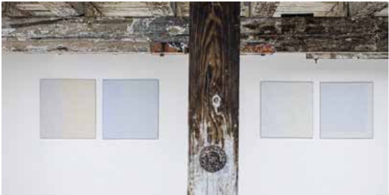
CHRISTA BARTESCH / CÍM NÉLKÜL (Fehér képek 1-4), 2006 / Oil on canvas

72. One thing was irrefutably clear to Goethe: no lightness can come out of darkness – just as more and more shadows do not produce light. This could be expressed as follows: we may call purple a reddish-whitish-blue or brown a blackish-reddish-yellow – but we cannot call a white a yellowish-reddish- greenish-blue, or something similar. And that is something that experiments with the spectrum neither confirm nor refute. It would, however, also be wrong to say, 'just look at the colours in nature and you will see that it is so.' Therefore looking does not teach us anything about the concepts of the colours."