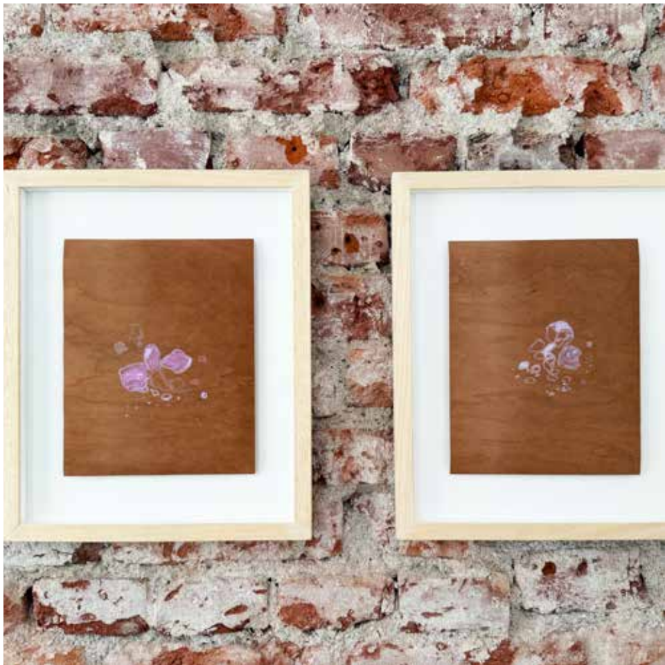
Paula Flores Kóokay 1 & Kóokay 2