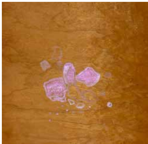
Paula Flores Kóokay 1 & Kóokay 2