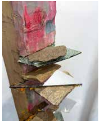
Paula Flores Tol /Details