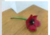
Zachari Logan Leshten Poppy & From Ossuary, 4 Flowers