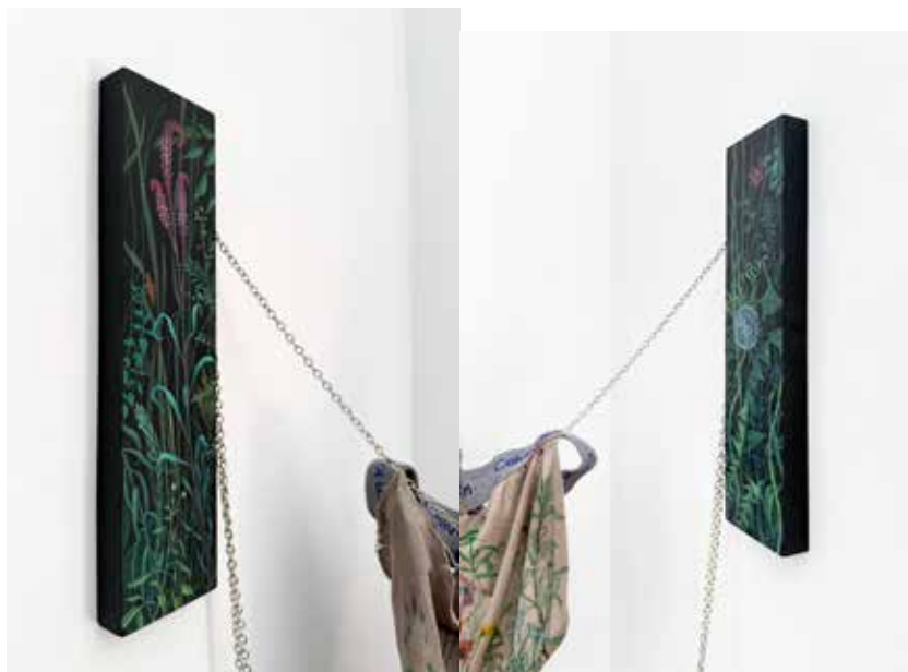
Zachari Logan Secret Garden Series Briefs, No. 3, Imagined Wildflowers & Weeds No. 1, 2