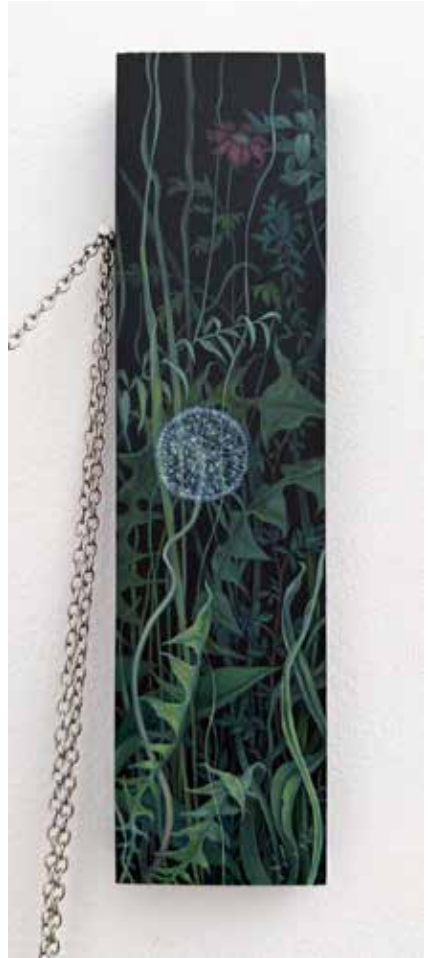
Zachari Logan Secret Garden Series, Imagined Wildflowers and Weeds No. 1, 2